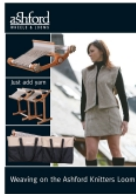
Weaving on the Ashford Knitters Loom