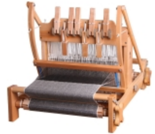
8 HARNESS TABLE LOOM