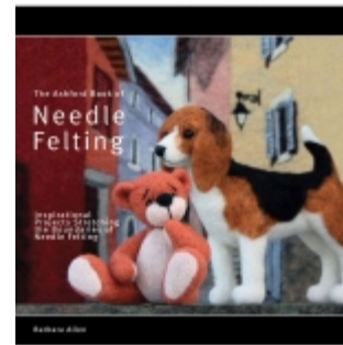
Ashford Book of Needle Felting