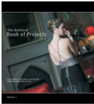
Ashford Book of Projects