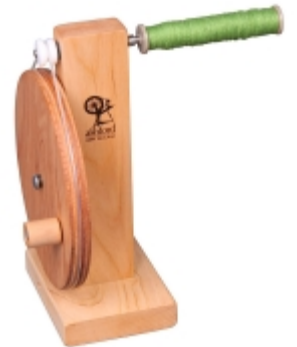
WOOD BOBBIN WINDER