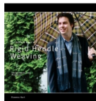
Ashford Book of Rigid Heddle Weaving $26.25