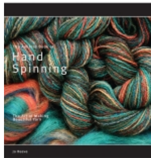
Ashford Book of Hand Spinning $26.25