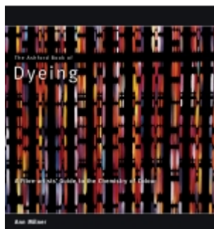
Ashford Book of Dyeing $30.95