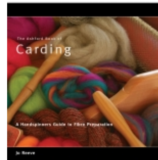
Ashford Book of Carding $26.25