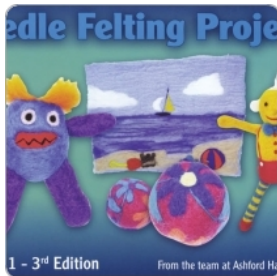
Needle Felting Projects 1