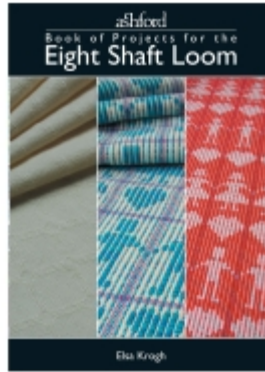
Ashford Book of Projects For the Eight Shaft Loom