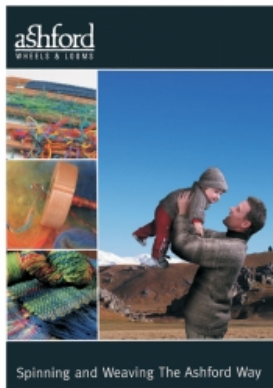
Spinning and Weaving The Ashford Way