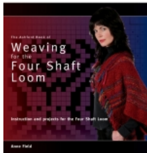
Weaving for the Four Shaft Loom $30.95

See in-depth descriptions at www.foxglovefiber.com