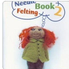
Needle Felting Projects 2